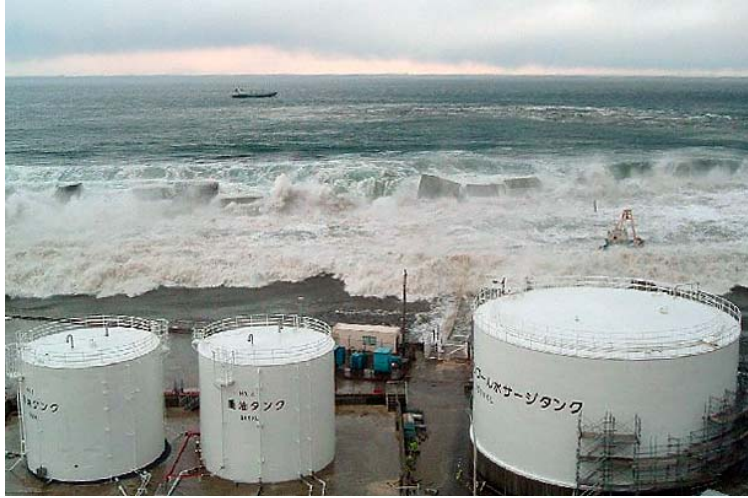
Figure 1: Tsunami striking the Fukushima Daiichi nuclear power plant on March 11, 2011.

On March 11, 2011, three operating Mark 1 BWRs at a power station in Fukushima, Japan (three out of the six at the site - the other 3 were not operating), shut down automatically and successfully when they experienced a huge magnitude 9.0 earthquake. One hour later cooling, driven by the backup generators, was proceeding normally when the generators were swamped by a large tsunami (see figure 1), causing the generators to stop and the ECCS systems to fail. The cores heated up uncontrollably and partially melted before the situation was brought under control though not before several hydrogen explosions occurred. Despite this series of failures, the secondary containment was largely successful. There were no deaths though some workers received non-lethal radiation doses. Figure 2 shows the evacuation area and radiation levels after 7 months (WNA 2014) near the damaged Fukushima Daiichi nuclear power plant.